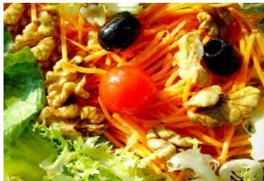
2006 "A clown at the salat" serie FACES PROJECT