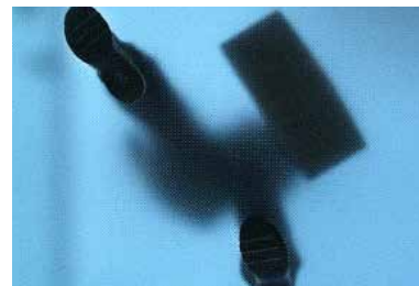
2010 "Skywalkers" serie done in Apple Stores in NEW YORK