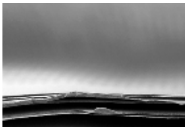
2009 "The Science Tree" serie THE READING LANDSCAPES