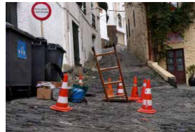
2007 "En España el trabajo está bien mirado" serie CONOS & CO.