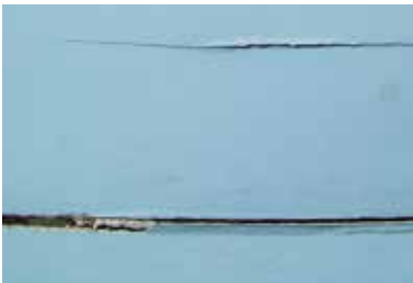
2005 "Sea Wave" Serie BLUE SEA, awarded 1st prize IPA 2007