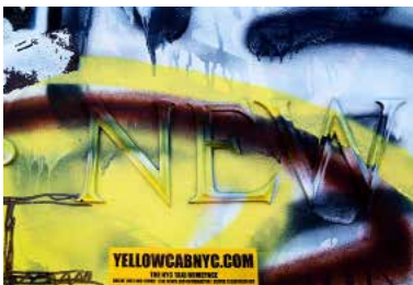
2008 "cartell NY_1" serie NEW YORK EXPERIENCE