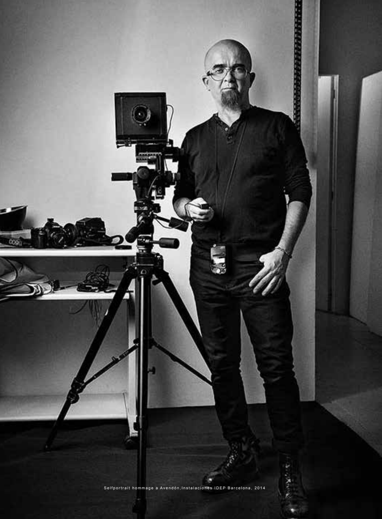
Selfportrait homage a Avendón, Instalaciones IDEP Barcelona, 2014