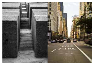
2005 "5th avenue" serie NEW YORK A CADAQUÉS