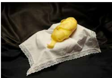
2003 "La Papa desnuda" humble to the work of Goya

Oamoros.com is my personal portfolio and artistic, a quick journey of 10 years from Cadaqués , NewYork , Denver or Barcelona. Here there is a small selection of these abstract works based on analogies.