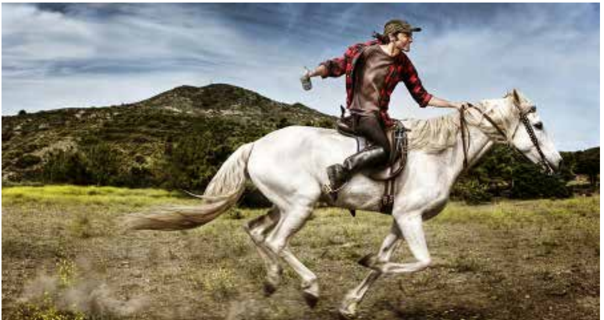
"Werens painting clouds", Serie I ALWAYS WANTED TO..." final piece from Advertising

Used to work in product photography and advertising still life, portrait model in studio or outdoors and artistic object. My passion is to give beauty to everyday objects. I 'm a good person ,kind, humble ,hardworking and creative with marked artistic side within the framework advertising .My motto : Tenacitas Omnia Vincit !