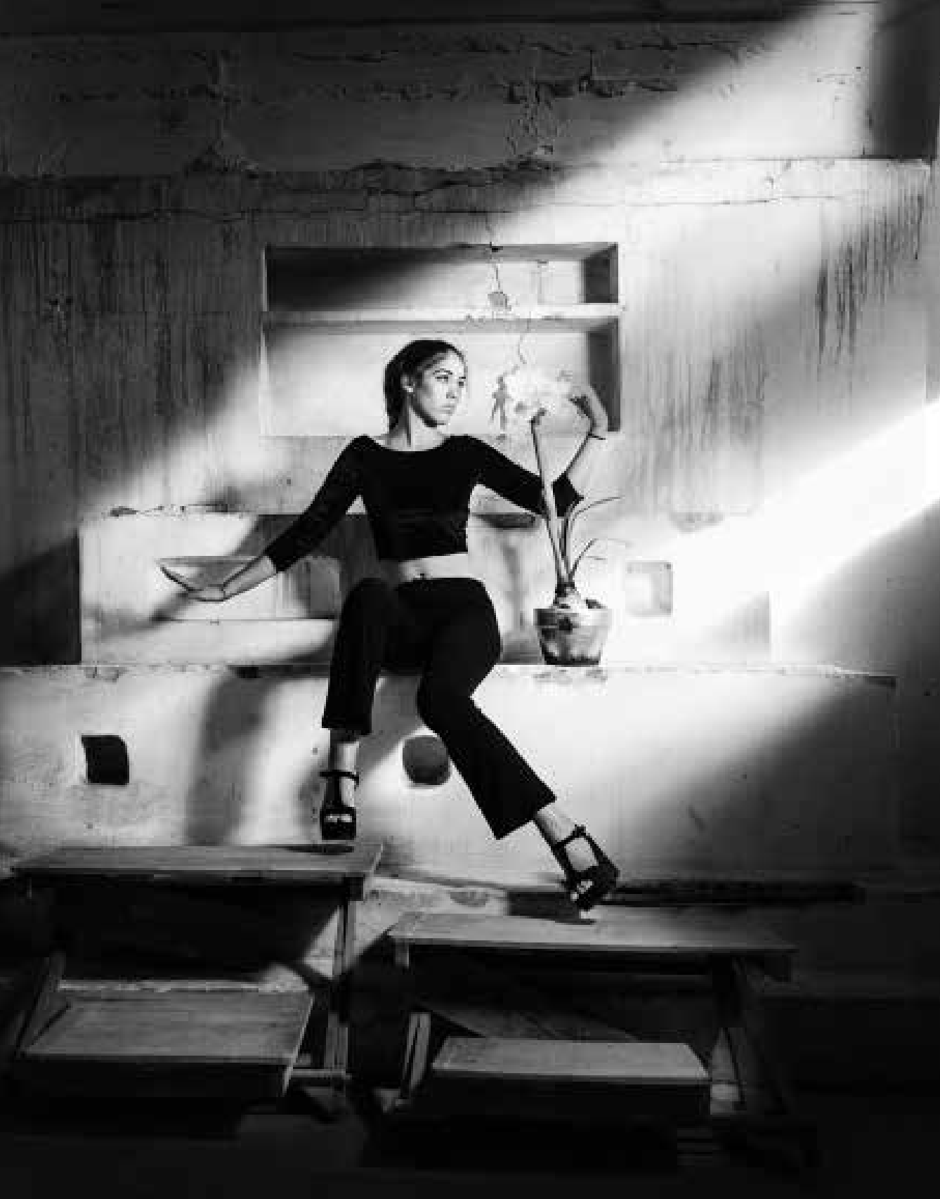
Model Session&retouch BNIab "Delirios de Gala", inspired in "La Venus" Salvador Dalí, 2015